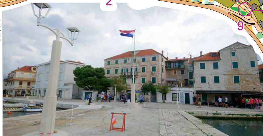
Day 2 Finish.