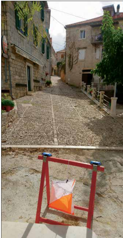
Day 2 Finish down the cobbles.

Stage 2 remained in Postira for a daytime Sprint race but on a new map. From a picturesque waterfront start location, the courses climbed around the western residential areas with some crucial route choices,