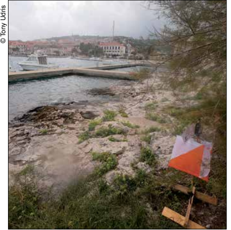
Day 1 Clouds.

island has a high point of 780m, covered by unique Black Pine trees and famed for its white rock (from which the winner's medals were specially made). In season,